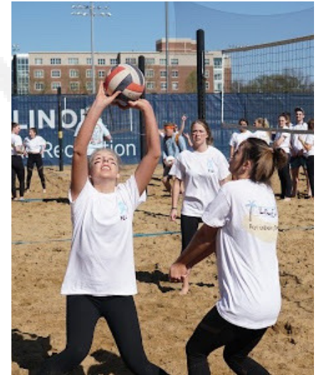
Right: A beautiful set up for a spike