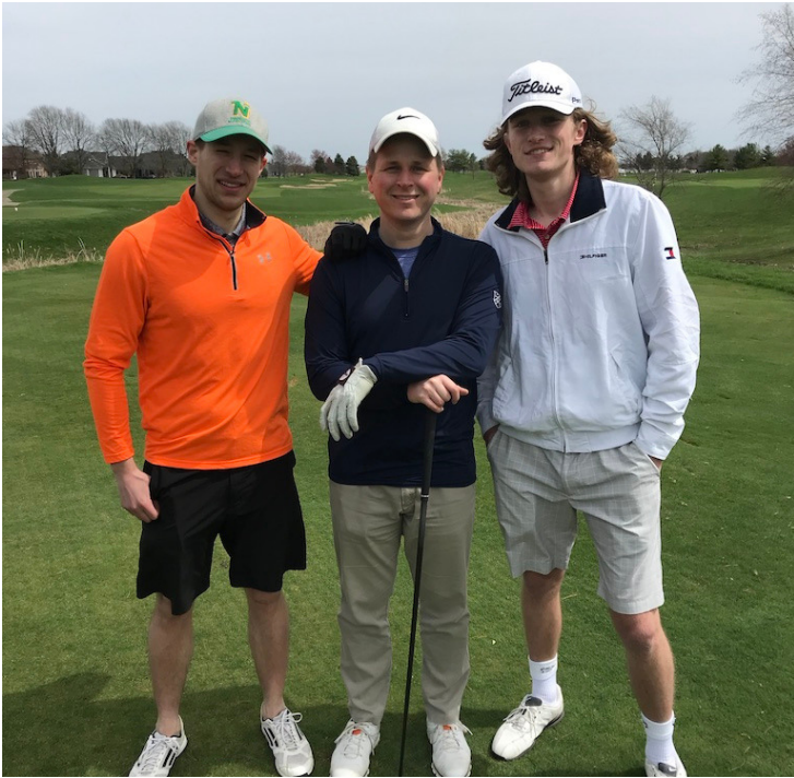
2019 Pig dinner golf outing