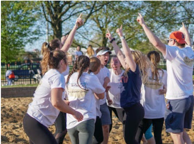
Left: Team celebrates a victory