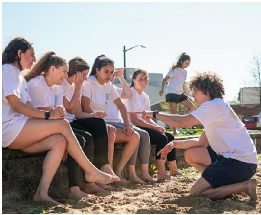
Philanthropy volleyball team listening to coaches instruction