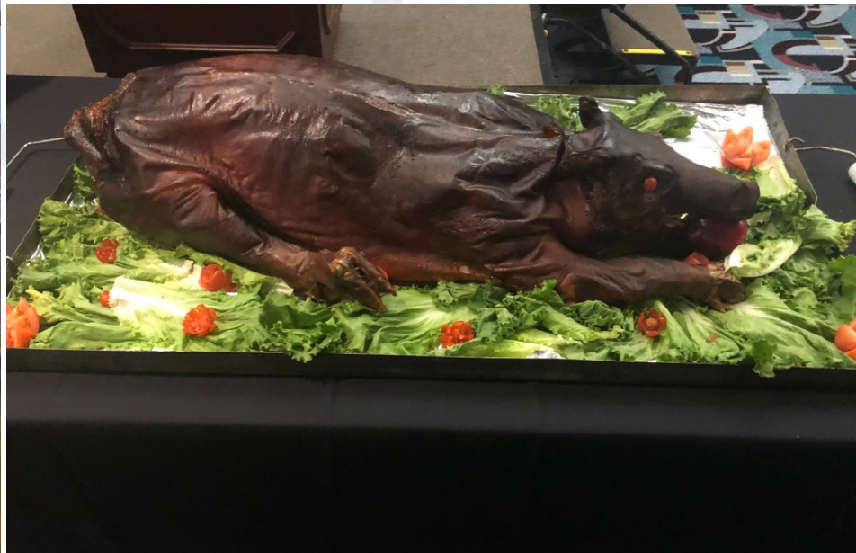
Below: The pig prepared by our culinary staff