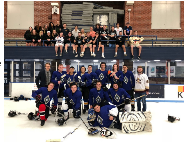
Above, the FIJI hockey team poses in front of the fan section full of brothers.