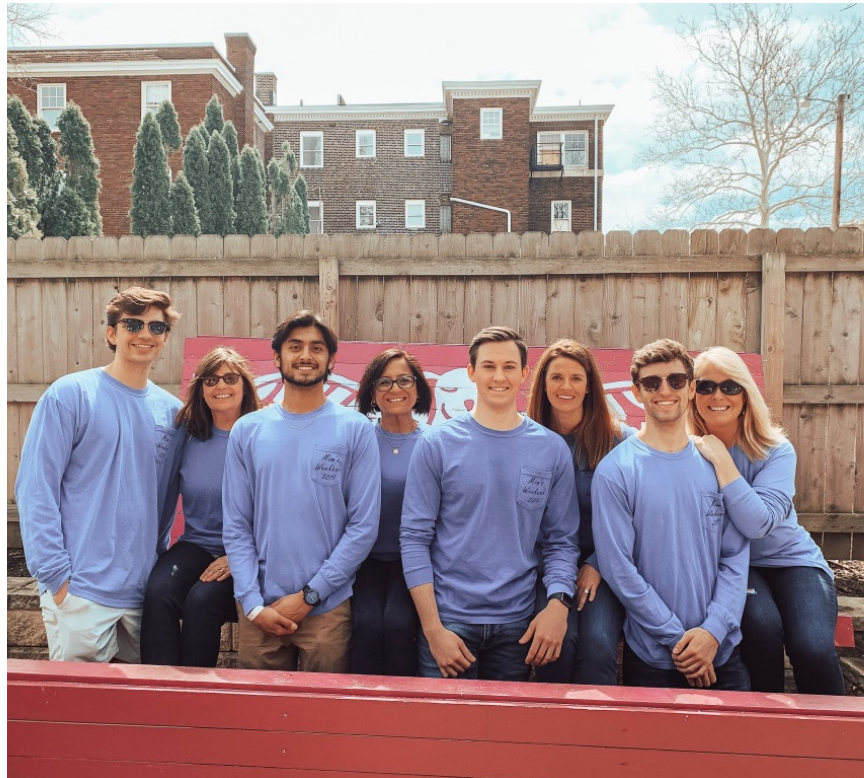
Several brothers hanging out on the Groniger patio during Mom's Weekend